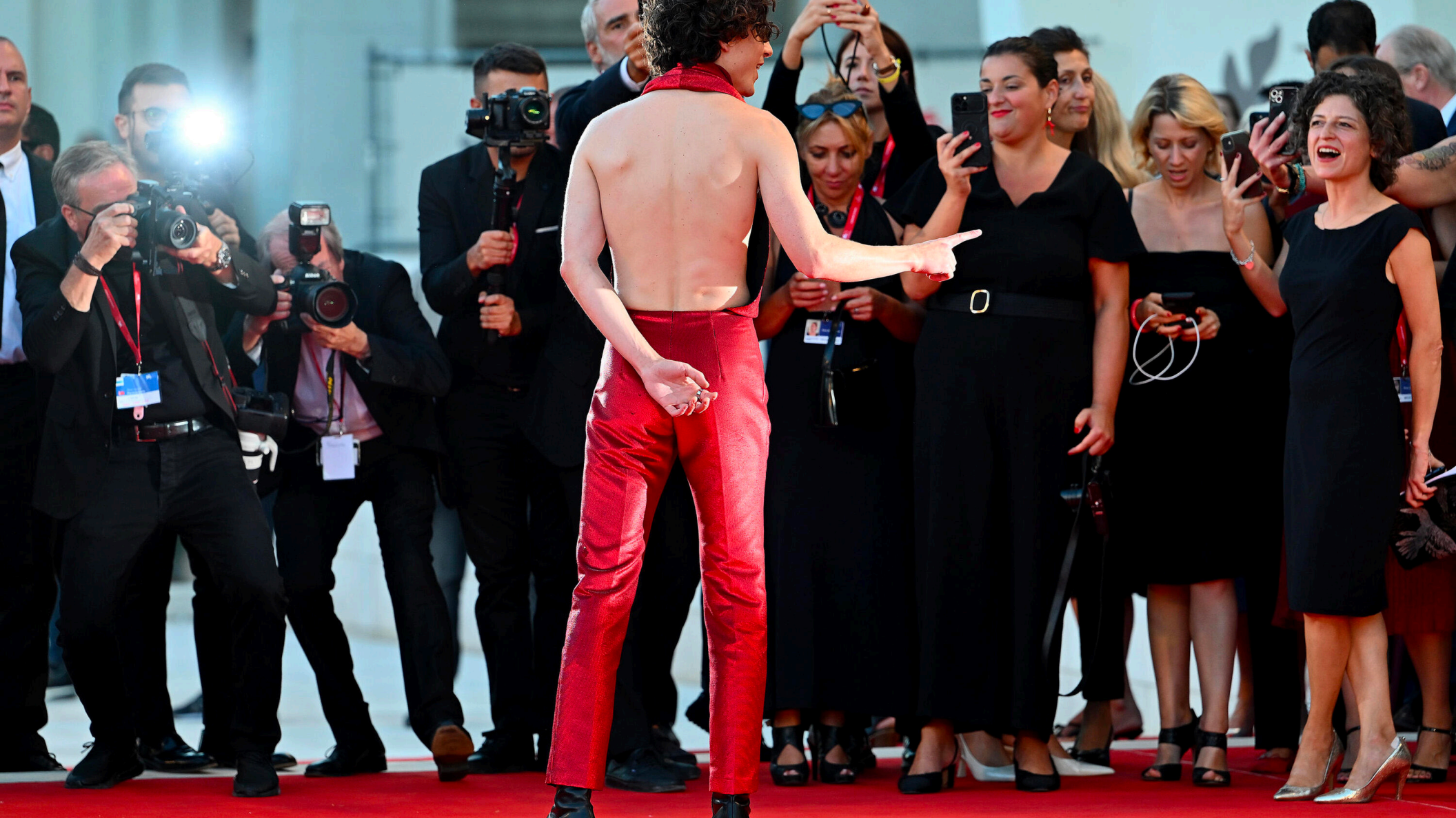
Timothée Chalamet in Haider Ackermann